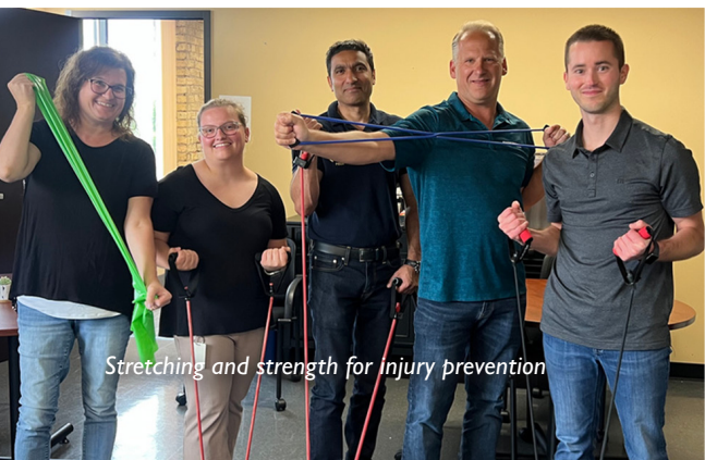
Stretching and strength for injury prevention