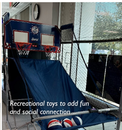
Recreational toys to add fun and social connection